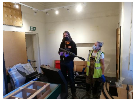
Fifex installing model weapons in Gallery 8 - 'Staying Alive'