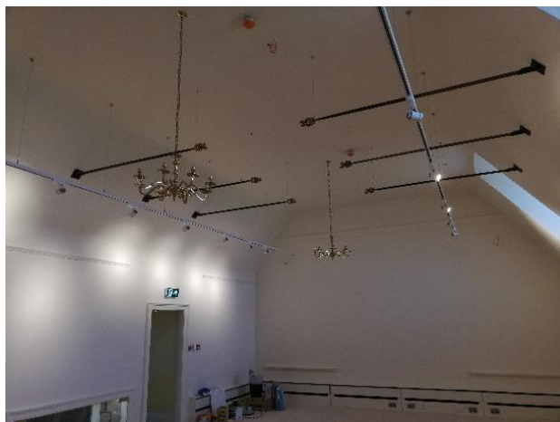
The Colours Room awaiting installation of the AV unit

At every step of the way, HES have continued to provide us with advice and support on the redevelopment together with continuing to carry out work on the fabric of the building. The roof and windows have now been overhauled although some leaks continue to plague us – and will no doubt continue to do so in the years to come! HES will be completing work on the new exit steps shortly and in mid-October they will be fitting out the retail spaces. The kitchen, a vital requirement to support catering in the museum, has been delayed due to archaeological and conservation works, but we hope that this will progress to enable us to install it in time for the opening.