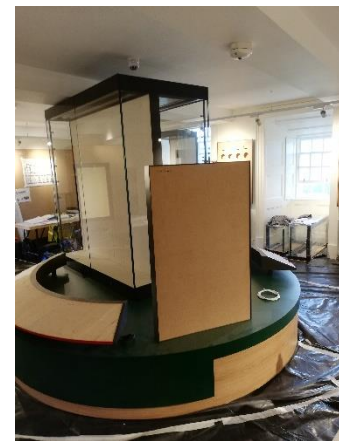
Music stand in Gallery 9 - 'Spirit of the Argylls'