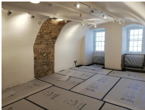
Ground Floor Gallery 3 - 'Service to The Crown' nearing completion

Due to the COVID restrictions within the site, the presence of the various trades has had to be carefully orchestrated imposing inevitable delay and slower than expected progress. However, work has pressed on and the major focus now is to complete the main staircase and the decoration of the Douglas Room, housing Gallery 7 - 'Our Scottish Roots'. Both have produced challenges. The 1 st and 2 nd Floors are complete and the Ground Floor is close to it.