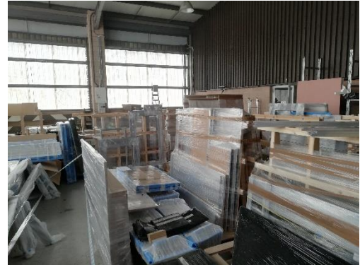
Storage at Forthside during lock-down

measured up and will shortly be producing the mounts for the display case exhibits.