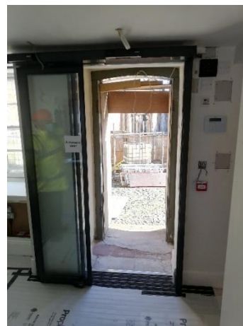
The new sliding entrance doors

We are very grateful to all the Guardians and members of the Regimental Association who continue to support the Museum most generously. We very much look forward to welcoming you all to the Museum at the earliest opportunity and involve you in the various activities that will take place. In due course we aim to expand the number of Guardians. If any of you know individuals who may be interested in joining, please let us know. Go to our website www.argylls.co.uk to find out how to join.